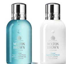
Coastal Cypress & Sea Fennel Bath & Shower Gel and Body Lotion