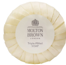
Triple Milled Soap - pleat wrapped Available in 25g (0.88oz) and 45g (1.59oz)

Enrich their cleansing ritual with our creamy triple-milled milk soaps, designed to clean, nourish and protect the skin.