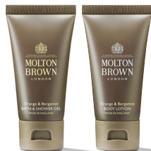
Orange & Bergamot Bath & Shower Gel and Body Lotion