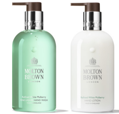
Refined White Mulberry Fine Liquid Hand Wash and Hand Lotion