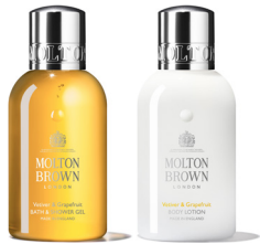
Vetiver & Grapefruit Bath & Shower Gel and Body Lotion

The plant and mineral extracts in our irresistibly scented shampoos and conditioners make hair look shiny and healthy with a beautiful, lingering fragrance.