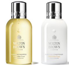
Indian Cress Purifying Shampoo and Conditioner