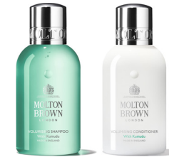
Kumudu Volumising Shampoo and Conditioner

Hair is thoroughly nourished and the scalp is refreshed. With cleansing Indian cress extract and shine-enhancing amino acids, hair is given a lustrous, healthy-looking finish, delicately fragranced with enticing aromas of jasmine, honeysuckle and sandalwood.