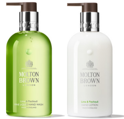
Lime & Patchouli Fine Liquid Hand Wash and Hand Lotion