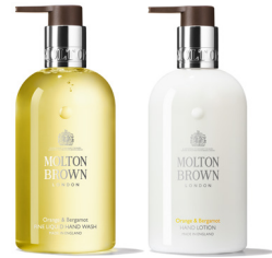
Orange & Bergamot Fine Liquid Hand Wash and Hand Lotion

Indulge your guests in our luxury hand care, bursting with rich, aromatic notes whilst nourishing and caring for the skin. House them in our chrome dispenser to add a sleek finishing touch to your bathrooms.