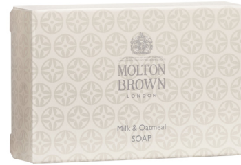
Milk & Oatmeal Soap Available in 75g (2.6oz)