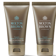
Coastal Cypress & Sea Fennel Bath & Shower Gel and Body Lotion