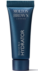
Extra-rich Bai Ji Hydrator With bai ji extract, this intense moisturiser minimises dryness while macadamia seed oil nourishes the face. Skin looks healthier and fresher with a firm, smooth and comfortable feel.