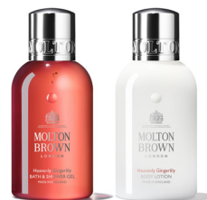
Heavenly Gingerlily Bath & Shower Gel and Body Lotion