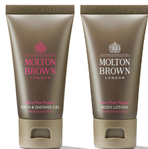
Fiery Pink Pepper Bath & Shower Gel and Body Lotion