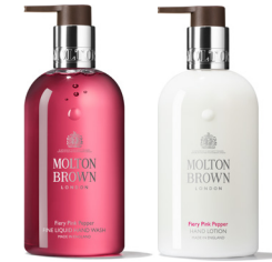
Fiery Pink Pepper Fine Liquid Hand Wash and Hand Lotion