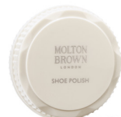
Shoe Polish (Resealable)