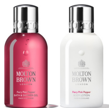
Fiery Pink Pepper Bath & Shower Gel and Body Lotion