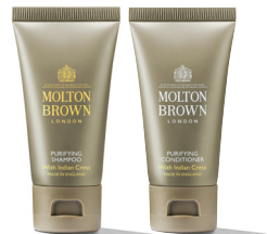
Indian Cress Purifying Shampoo and Conditioner

The plant and mineral extracts in our irresistibly scented shampoos and conditioners make hair look shiny and healthy with a beautiful, lingering fragrance.