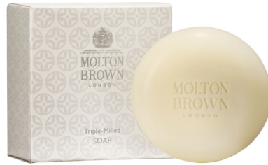
Triple Milled Soap - boxed Available in 25g (0.88oz) and 45g (1.59oz)