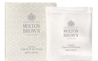
Coastal Cypress & Sea Fennel Bath Salts

Surprise your guests with delightful, mini-sized fragrant gifts, enhancing their sense of wellbeing for a little extra comfort.