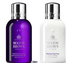
Relaxing Ylang-Ylang Bath & Shower Gel and Body Lotion