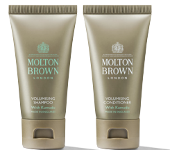
Kumudu Volumising Shampoo and Conditioner

Out with daily grime. In with a shampoo for smooth, shiny hair with aromas of jasmine, honeysuckle and sandalwood.