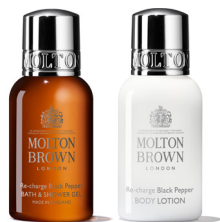
Re-charge Black Pepper Bath & Shower Gel and Body Lotion