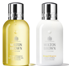
Orange & Bergamot Bath & Shower Gel and Body Lotion