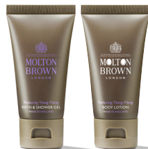
Relaxing Ylang-Ylang Bath & Shower Gel and Body Lotion