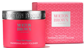
Fieri Pink Pepper Pampering Body Polisher

Each indulgent Body Polisher is enriched with a unique exfoliating ingredient and iconic fragrance. Experience caressingly soft, beautifully scented skin.