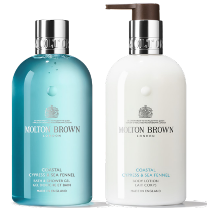
Bath & Shower Gel and Body Lotion 300ml (10.1 fl oz) H15.4cm