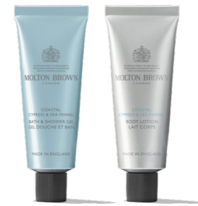
Bath & Shower Gel and Body Lotion 30ml (1 fl oz) H11.5cm