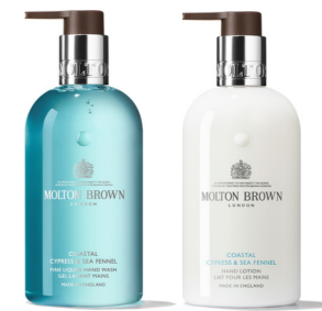
Coastal Cypress & Sea Fennel Fine Liquid Hand Wash and Hand Lotion

A humid sunset simmers in a paradise of lush slopes. The warm, crushed sweet spice of jewel-like pink pepper, lively ginger and jasmine drifts over colourful rooftops. A dramatic dusk of rich patchouli, cedarwood and oakmoss deepens. Rouse your senses; entice curiosity with aromatic adventure.