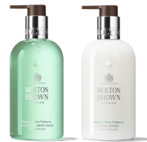
Refined White Mulberry Fine Liquid Hand Wash and Hand Lotion

An alfresco bay market, vibrant with abundant flavours. The unmistakable zing of freshly squeezed lime and uplifting eucalyptus pierce the air. Crushed cardamom reveals an unexpected spicy twist wrapped in the rich depths of patchouli. Express your lively side; revitalise with citrusy freshness.