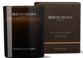
Re-charge Black Pepper Signature Candle