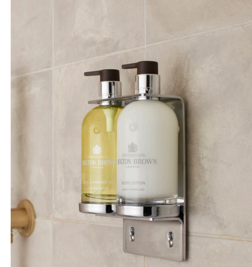
Top: Orange & Bergamot Double Dispenser Bottom: Porcelain Decanters

*Only available in the UK & EMEA Regions.