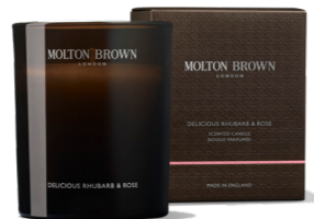
Delicious Rhubarb & Rose Signature Candle

This is a selection from our collection. For more information, ask a Molton Brown representative or check online at moltonbrown.com