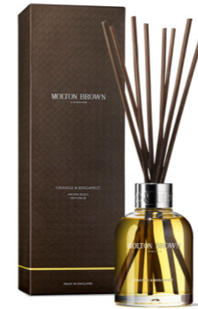
Orange & Bergamot Aroma Reeds

The world's most evocative aromas – expertly distilled. An understated way to elegantly scent any space, our Aroma Reeds collection makes a striking statement of its own. Delight your guests from their first step through the door with our iconic fragrances.