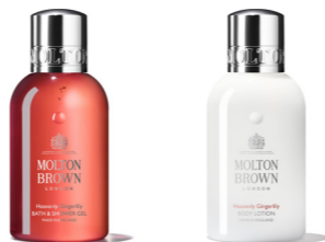
Heavenly Gingerlily Bath & Shower Gel and Body Lotion

A humid sunset simmers in a paradise of lush slopes. The warm, crushed sweet spice of jewel-like pink pepper, lively ginger and jasmine drifts over colourful rooftops. A dramatic dusk of rich patchouli, cedarwood and oakmoss deepens. Rouse your senses; entice curiosity with aromatic adventure.