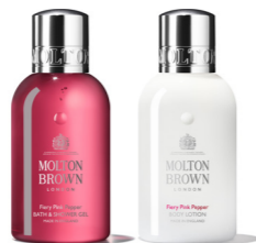
Fiery Pink Pepper Bath & Shower Gel and Body Lotion

Available in 30ml (1 fl oz), 50ml (1.7 fl oz), 100ml (3.3 fl oz), 300ml (10.1 fl oz), 360ml (12.1 fl oz) except Fiery Pink Pepper and 5L* (169.1 fl oz) except Fiery Pink Pepper and Heavenly Gingerlily Body Lotions.