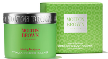
Infusing Eucalyptus Stimulating Body Polisher

This is a selection from our extensive collection. For more information, ask a Molton Brown representative or check online at moltonbrown.com