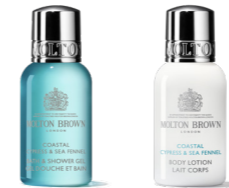
Bath & Shower Gel and Body Lotion 30ml (1 fl oz) H7.6cm

Choose between our different packaging and sizes that best suits your hotel. Our new aluminum tubes have a sleek design with more height compared to their 30ml plastic version – a detail bound to be appreciated by guests.