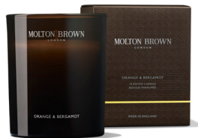
Orange & Bergamot Signature Candle

Welcome your guests into an inviting ambience with the flickering glow of candlelight. Immediately imbue the room with cosy, cocooning notes or instil the most radiant, composed fragrances to turn their moments into memories.