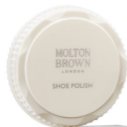
Resealable Shoe Polish