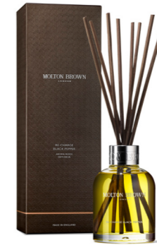
Re-charge Black Pepper Aroma Reeds