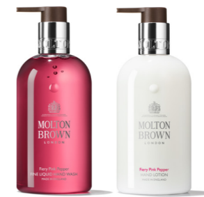
Fiery Pink Pepper Fine Liquid Hand Wash and Hand Lotion

Available in 200ml, (6.8 fl oz) 300ml (10.1 fl oz), 360ml (12.1 fl oz) except Fiery Pink Pepper and Refined White Mulberry and 5L (169.1 fl oz).