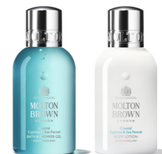
Coastal Cypress & Sea Fennel Bath & Shower Gel and Body Lotion

Available in 30ml (1 fl oz), 50ml (1.7 fl oz), 100ml (3.3 fl oz), 300ml (10.1 fl oz), 360ml (12.1 fl oz) except Relaxing Ylang-Ylang and Serene Coco & Sandalwood and 5L* (169.1 fl oz) except Relaxing Ylang-Ylang Body Lotion.