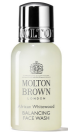
African Whitewood Balancing Face Wash

The perfectly formed 'rejuvenate and revive' collection. Skin is purified, energised and conditioned, enabling your globetrotting guests to put their best face forward at every stage of their journey.