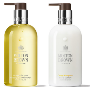
Orange & Bergamot Fine Liquid Hand Wash and Hand Lotion

Indulge your guests in our luxury Hand Care, bursting with rich, aromatic notes whilst nourishing and caring for the skin. House them in our chrome dispenser to add a sleek finishing touch to your bathrooms.