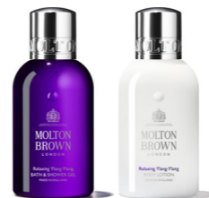
Relaxing Ylang-Ylang Bath & Shower Gel and Body Lotion

Black sands slip into a crystal-clear lagoon. Delicate petals of graceful lily and creamy tuberose softly float along the surface. Fragrantly spiced, cool cardamom and vibrant ginger layer warm cedarwood in a perfumed breeze. Dream of idyllic bliss; entice your wanderlust with an escape to island shores.