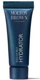
Extra-rich Bai Ji Hydrator

With bai ji extract, this intense moisturiser minimises dryness while macadamia seed oil nourishes the face. Skin looks healthier and fresher with a firm, smooth and comfortable feel.