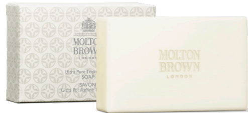
ULTRA PURE Triple Milled Soap boxed

Available in 25g (0.88oz) and 45g (1.59oz)