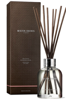
Delicious Rhubarb & Rose Aroma Reeds

This is a selection from our collection. For more information, ask a Molton Brown representative or check online at moltonbrown.com