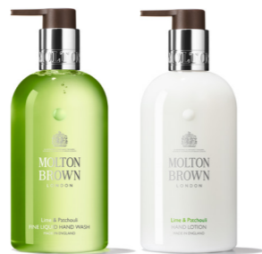
Lime & Patchouli Fine Liquid Hand Wash and Hand Lotion

Available in 300ml (10.1 fl oz), 360ml (12.1 fl oz) except Lime & Patchouli and 5L (169.1 fl oz).