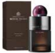
FIERY PINK PEPPER EAU DE PARFUM