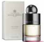
FIERY PINK PEPPER EAU DE TOILETTE