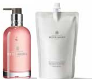
DELICIOUS RHUBARB & ROSE Fine Liquid Hand Wash Glass Bottle 200ml Fine Liquid Hand Wash Refill 400ml NTB218S/NXH218