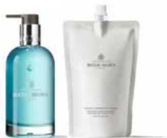
COASTAL CYPRESS & SEA FENNEL Fine Liquid Hand Wash Glass Bottle 200ml Fine Liquid Hand Wash Refill 400ml NTB251S/NXH251

Uncover our plastic-reducing Refill pouches and Glass Bottles. Crafted from thick-cut glass, our elegant bottle is not only 100% recyclable, but has a durable, weighted base – a beautiful gift they'll treasure forever.