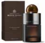
RE-CHARGE BLACK PEPPER EAU DE PARFUM

Composed by renowned perfumers, our bestselling Eaux de Toilette and Eaux de Parfum are made in England with high fragrance concentrations, making them the ideal unforgettable gift. Discover a one-of-a-kind scent, perfectly balanced and exceptionally made to suit every type of personality.