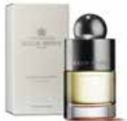
RE-CHARGE BLACK PEPPER EAU DE TOILETTE