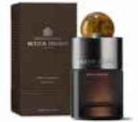
TOBACCO ABSOLUTE EAU DE PARFUM