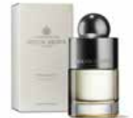
TOBACCO ABSOLUTE EAU DE TOILETTE