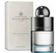
COASTAL CYPRESS & SEA FENNEL EAU DE TOILETTE