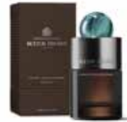
COASTAL CYPRESS & SEA FENNEL EAU DE PARFUM