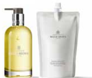
ORANGE & BERGAMOT Fine Liquid Hand Wash Glass Bottle 200ml Fine Liquid Hand Wash Refill 400ml NTB009S/NXH009