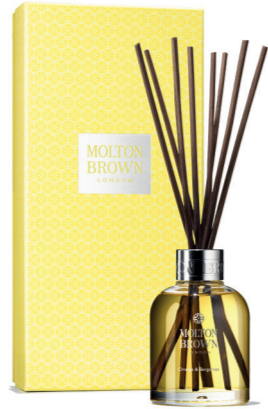
Orange & Bergamot Aroma Reeds Top notes of bergamot, lemon and mandarin. A heart of orange, ginger and cinnamon. A base of neroli and musk.