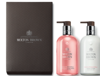
Delicious Rhubarb & Rose Hand Wash & Lotion Set Fine Liquid Hand Wash 300ml Hand Lotion 300ml

Molton Brown is proudly the "Official Supplier of Toiletries" to Tottenham Hotspur Football Club and Tottenham Hotspur Stadium