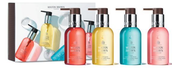
Floral & Marine Hand Gift Set