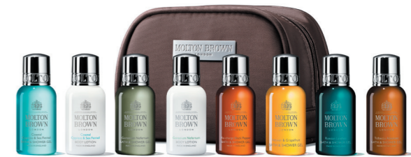
The Daring Adventurer Mini Travel Bag