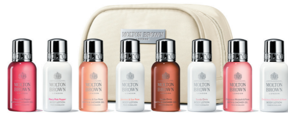
The Exquisite Escapist Mini Travel Bag