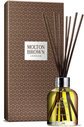
Black Peppercorn Aroma Reeds Top notes of black pepper, lemon and ginger. A heart of coriander oil and basil. A base of vetiver, oak moss and amber gris.