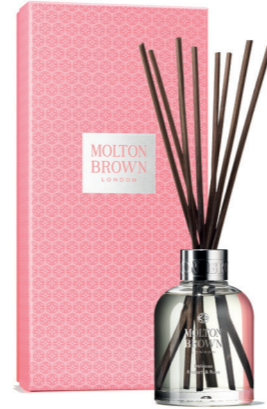
Delicious Rhubarb & Rose Aroma Reeds Top notes of grapefruit, yuzu and lemongrass. A heart of rhubarb leaf, rose and spearmint. A base of vanilla, musk and spun sugar.