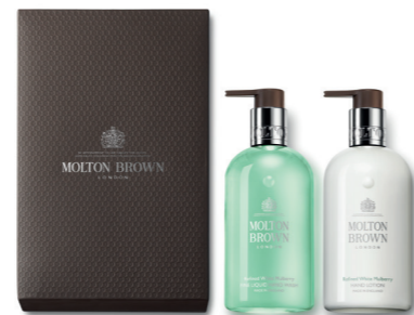
Refined White Mulberry Hand Wash & Lotion Set Fine Liquid Hand Wash 300ml Hand Lotion 300ml