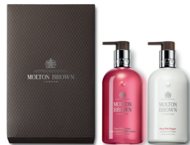
Fiery Pink Pepper Hand Wash & Lotion Set Fine Liquid Hand Wash 300ml Hand Lotion 300ml