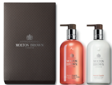
Heavenly Gingerlily Hand Wash & Lotion Set Fine Liquid Hand Wash 300ml Hand Lotion 300ml