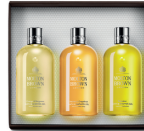
NEW Citrus Gift Set Orange & Bergamot Bath & Shower Gel 300ml Vetiver & Grapefruit Bath & Shower Gel 300ml Bushukan Bath & Shower Gel 300ml