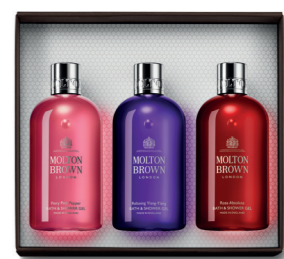
NEW Women's Trio Gift Set Fiery Pink Pepper Bath & Shower Gel 300ml Relaxing Ylang-Ylang Bath & Shower Gel 300ml Rosa Absolute Bath & Shower Gel 300ml