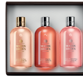
NEW Floral & Fruity Gift Set Jasmine & Sun Rose Bath & Shower Gel 300ml Heavenly Gingerlily Bath & Shower Gel 300ml Delicious Rhubarb & Rose Bath & Shower Gel 300ml