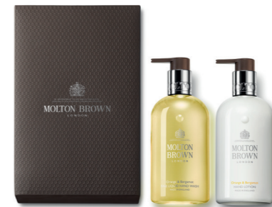
Orange & Bergamot Hand Wash & Lotion Set Fine Liquid Hand Wash 300ml Hand Lotion 300ml