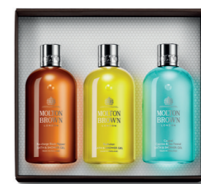
NEW Men's Trio Gift Set Re-charge Black Pepper Bath & Shower Gel 300ml Bushukan Bath & Shower Gel 300ml Coastal Cypress & Sea Fennel Bath & Shower Gel 300ml