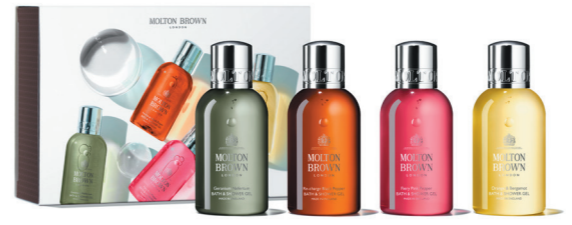
Spicy & Citrus Bathing Gift Set