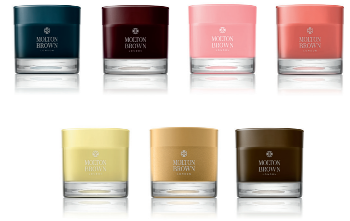
Set of 3 Mini Candles Encased in a luxurious candle gift box

Choose from: Russian Leather, Black Peppercorn, Delicious Rhubarb & Rose, Gingerlily, Orange & Bergamot, Oudh Accord & Gold, Tobacco Absolute