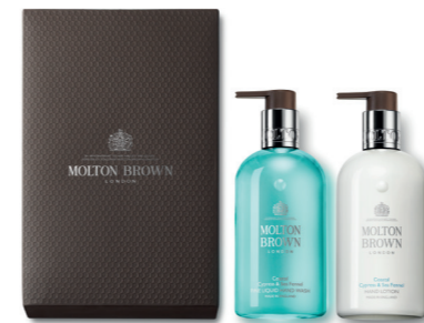
Coastal Cypress & Sea Fennel Hand Wash & Lotion Set Fine Liquid Hand Wash 300ml Hand Lotion 300ml