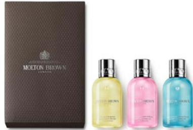
Hand Sanitiser Gel Trio Gift Set Orange & Bergamot 100ml Delicious Rhubarb & Rose 100ml Coastal Cypress & Sea Fennel 100ml WBB1132

Now more essential than ever. Our Hand Sanitiser Gels are formulated to kill 99.9% bacteria and enveloped viruses, keeping hands feeling fresh, clean and safe on-the-go.*