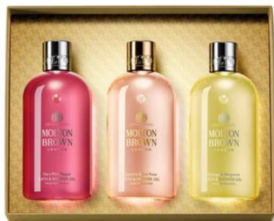
Floral & Spicy Collection 3 x 300ml Bath & Shower Gels: Fiery Pink Pepper Jasmine & Sun Rose Orange & Bergamot MBC21029

For energising morning showers and decadent night-time soaks. Enliven their bathing ritual all-year-round with our best loved floral, spicy and woody notes.