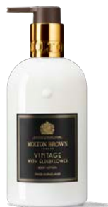
Body Lotion 300ml NNB0179