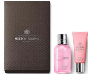
Delicious Rhubarb & Rose Hand Sanitiser Gel & Cream Gift Set Hand Sanitiser 100ml Hand Cream 40ml WBB1137

*Only available in UK, Germany and Austria.