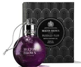
Festive Bauble 75ml NEB9248