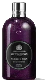
Bath & Shower Gel 300ml NJB249