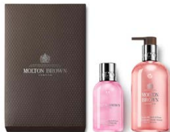
Delicious Rhubarb & Rose Hand Sanitiser & Wash Gift Set Hand Sanitiser 100ml Fine Liquid Hand Wash 300ml WBB1140