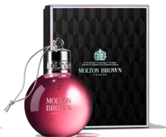
Fiery Pink Pepper 75ml NEB21034