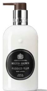
Body Lotion 300ml NJB229