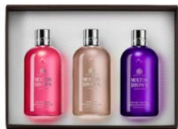
Floral Bathing Gift Set

Say thank you, wish them a happy anniversary or a heartfelt congratulations.