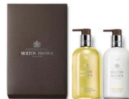
Orange & Bergamot Hand Wash & Lotion gift Set Fine Liquid Hand Wash 300ml Hand Lotion 300ml WBB002