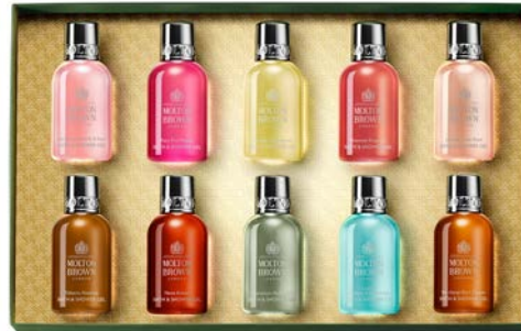
Stocking Filler Collection