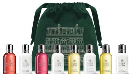
Luxury Escape Collection Heavenly Gingerlily Bath & Shower Gel 50ml Heavenly Gingerlily Body Lotion 50ml Fiery Pink Pepper Bath & Shower Gel 50ml Fiery Pink Pepper Body Lotion 50ml Indian Cress Purifying Shampoo 50ml Indian Cress Purifying Conditioner 50ml Orange & Bergamot Bath & Shower Gel 50ml Orange & Bergamot Body Lotion 50ml WBB302