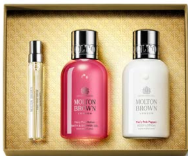
Fiery Pink Pepper Fragrance Collection

Eau de Toilette 7.5ml Bath & Shower Gel 100ml Body Lotion 100ml MBC21024