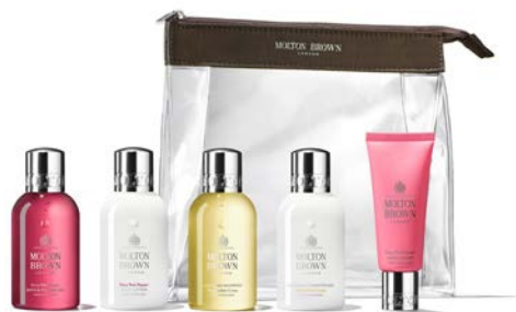
The Enticing Wanderer Carry-On Bag Fiery Pink Pepper Bath & Shower Gel 100ml Fiery Pink Pepper Body Lotion 100ml Purifying Shampoo With Indian Cress 100ml Purifying Conditioner With Indian Cress 100ml Fiery Pink Pepper Hand Cream 40ml MBG20050