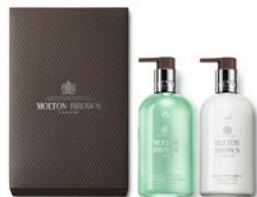
Refined White Mulberry Hand Wash & Lotion Gift Set Fine Liquid Hand Wash 300ml Hand Lotion 300ml WBB004