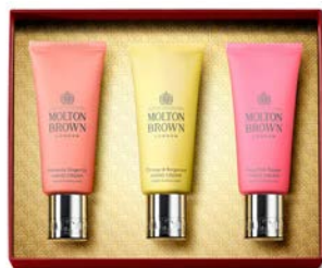
Hand Care Collection 3 x 40ml Hand Creams: Fiery Pink Pepper Heavenly Gingerlily Orange & Bergamot MBC21023

Deeply cleanse and tenderly care for dry hands everyday. Pick from our selection of nourishing Hand Creams, Fine Liquid Hand Washes and Lotions, fragranced with uplifting scents.