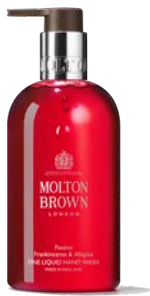
Fine Liquid Hand Wash