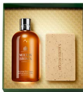
Re-charge Black Pepper Collection Bath & Shower Gel 300ml Bodyscrub Bar 250g MBC21026