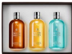
Woody & Citrus Bathing Gift Set

Fiery Pink Pepper Bath & Shower Gel 300ml Suede Orris Bath & Shower Gel 300ml Relaxing Ylang-Ylang Bath & Shower Gel 300ml WBB1061