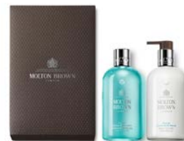
Coastal Cypress & Sea Fennel Bathing Gift Set Bath & Shower Gel 300ml Body Lotion 300ml WBB371