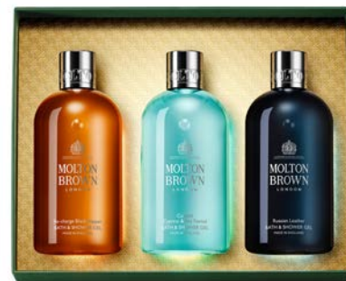
Woody & Aromatic Collection 3 x 300ml Bath & Shower Gels: Re-charge Black Pepper Coastal Cypress & Sea Fennel Russian Leather MBC21030