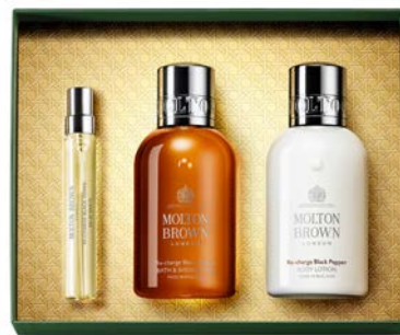
Re-charge Black Pepper Fragrance Collection

Eau de Toilette 7.5ml Bath & Shower Gel 100ml Body Lotion 100ml MBC21024