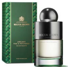
Eau de Toilette 100ml NMK290