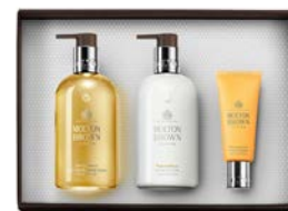
Flora Luminare Hand Gift Set Fine Liquid Hand Wash 300ml Hand Lotion 300ml Hand Cream 40ml WBB1188