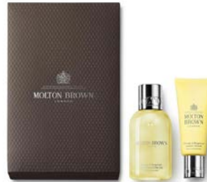
Orange & Bergamot Hand Sanitiser Gel & Cream Gift Set Hand Sanitiser 100ml Hand Cream 40ml WBB1136