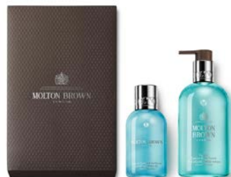
Coastal Cypress & Sea Fennel Hand Sanitiser & Wash Gift Set Hand Sanitiser 100ml Fine Liquid Hand Wash 300ml WBB1138

Uplift their everyday routine and keep their hands deeply cleansed and protected.