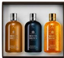
Woody Gift Set

Vetiver & Grapefruit Bath & Shower Gel 300ml Orange & Bergamot Bath & Shower Gel 300ml Flora Luminare Bath & Shower Gel 300ml WBB1063