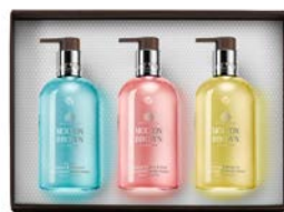
Classic Hand Gift Set Coastal Cypress & Sea Fennel Fine Liquid Hand Wash 300ml Delicious Rhubarb & Rose Fine Liquid Hand Wash 300ml Orange & Bergamot Fine Liquid Hand Wash 300ml WBB1178