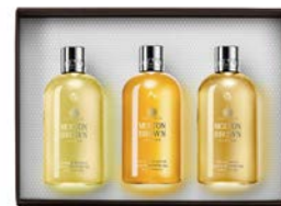
Floral & Citrus Bathing Gift Set

Re-charge Black Pepper Bath & Shower Gel 300ml Vetiver & Grapefruit Bath & Shower Gel 300ml Coastal Cypress & Sea Fennel Bath & Shower Gel 300ml WBB1062