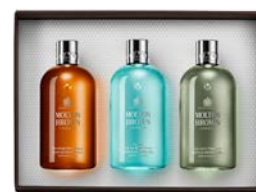
Spicy & Aromatic Bathing Gift Set

Jasmine & Sun Rose Bath & Shower Gel 300ml Heavenly Gingerlily Bath & Shower Gel 300ml Delicious Rhubarb & Rose Bath & Shower Gel 300ml WBB1065