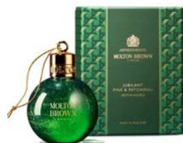
Festive Bauble 75ml NEB290