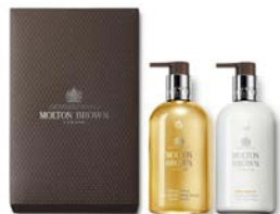
Flora Luminare Hand Wash & Lotion Gift Set Fine Liquid Hand Wash 300ml Hand Lotion 300ml WBB1187