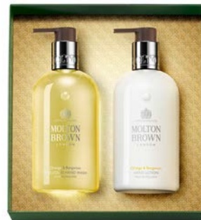
Orange & Bergamot Hand Collection Fine Liquid Hand Wash 300ml Hand Lotion 300ml MBC21031