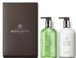
Lime & Patchouli Hand Wash & Lotion gift Set Fine Liquid Hand Wash 300ml Hand Lotion 300ml WBB003

Refresh and hydrate palms to fingertips, finished with a beautiful fragrance.