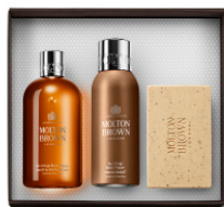
Re-charge Black Pepper Heroes Gift Set Bath & Shower Gel 300ml Deodorant Spray 150ml Bodyscrub Bar 250g WBB195