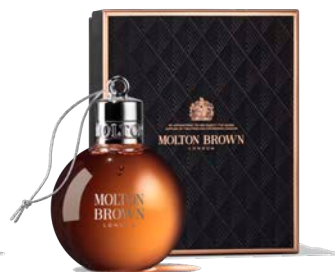
Re-charge Black Pepper 75ml NEB21037