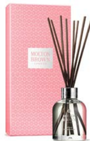
Delicious Rhubarb & Rose 150ml DIF103