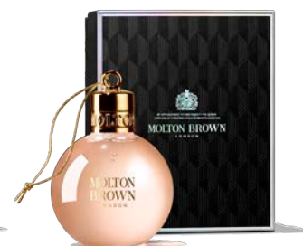
Jasmine & Sun Rose 75ml NEB0242