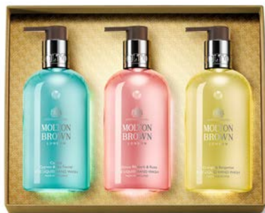
Citrus & Fruity Hand Collection 3 x 300ml Fine Liquid Hand Washes: Coastal Cypress & Sea Fennel Delicious Rhubarb & Rose Orange & Bergamot MBC21034