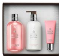
Delicious Rhubarb & Rose Pamper Gift Set Bath & Shower Gel 300ml Body Lotion 300ml Hand Cream 40ml WBB1181