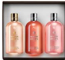
Floral & Fruity Bathing Gift Set

Tobacco Absolute Bath & Shower Gel 300ml Russian Leather Bath & Shower Gel 300ml Mesmerising Oudh Accord & Gold Bath & Shower Gel 300ml WBB1064