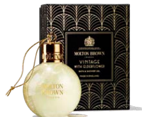
Festive Bauble 75ml NEB0178