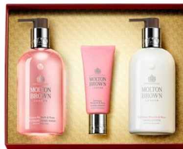
Delicious Rhubarb & Rose Hand Collection Fine Liquid Hand Wash 300ml Hand Cream 40ml Hand Lotion 300ml MBC21035