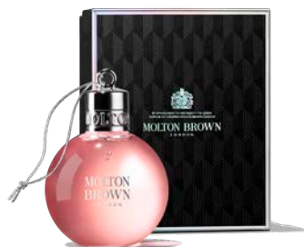
Delicious Rhubarb & Rose 75ml NEB0103

Festoon their tree with an extra twinkle. Our classic selection of baubles are glowing with our most-loved Bath & Shower Gels.