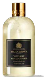
Bath & Shower Gel 300ml NNB0178