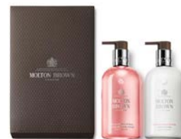
Delicious Rhubarb & Rose Hand Wash & Lotion gift Set Fine Liquid Hand Wash 300ml Hand Lotion 300ml WBB069