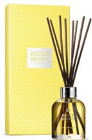
Orange & Bergamot 150ml DIF012

The world's most evocative aromas – expertly distilled. An understated way to elegantly scent any space, our Aroma Reeds collection makes a striking statement of its own.