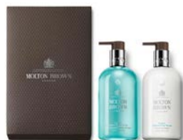
Coastal Cypress & Sea Fennel Hand Wash & Lotion gift Set Fine Liquid Hand Wash 300ml Hand Lotion 300ml WBB396