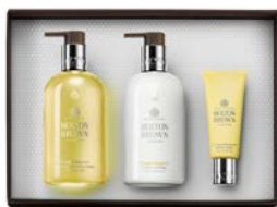
Orange & Bergamot Hand Care Gift Set Fine Liquid Hand Wash 300ml Hand Lotion 300ml Hand Cream 40ml WBB1181