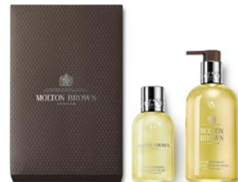
Orange & Bergamot Hand Sanitiser & Wash Gift Set Hand Sanitiser 100ml Fine Liquid Hand Wash 300ml WBB1139

*Only available in UK, Germany and Austria.