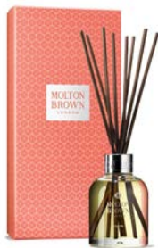
Heavenly Gingerlily 150ml DIF011