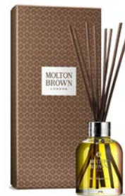
Re-charge Black Pepper 150ml DIF017